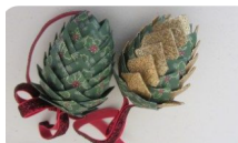
Anne - Somerset patchwork fir cone tree decorations