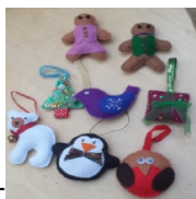
Liz - Felt Xmas decorations