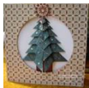
Jennie - Tea bag folded Xmas cards

The activities cannot be pre booked this year.